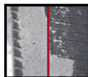
DYNAMIC BALANCE (left of centre)