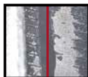
DYNAMIC BALANCE (right of centre)

Most internal balancing products on the market only balance statically (up and down) however, a tire can be out of balance dynamically as well (left and right) As you can see in the pictures below, Counteract Balancing Beads is able to balance Statically and Dynamically ensuring that your entire wheel assembly is always balanced.